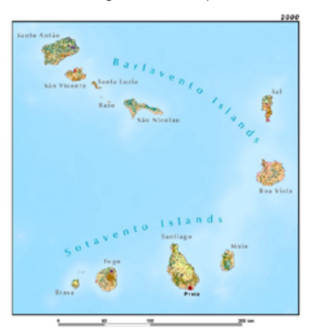
Map 1: Map of the Republic of Cabo Verde.

Each component was measured by a set of criteria that address a particular aspect of a functional EP&R system for Cabo Verde. In turn, each criterion included a set of four indicators, each with five key attributes that gauge the maturity of that aspect of the of the preparedness and response system. In total, the Diagnostic examined 360 individual data points related to the strength of the EP&R system in Cabo Verde.