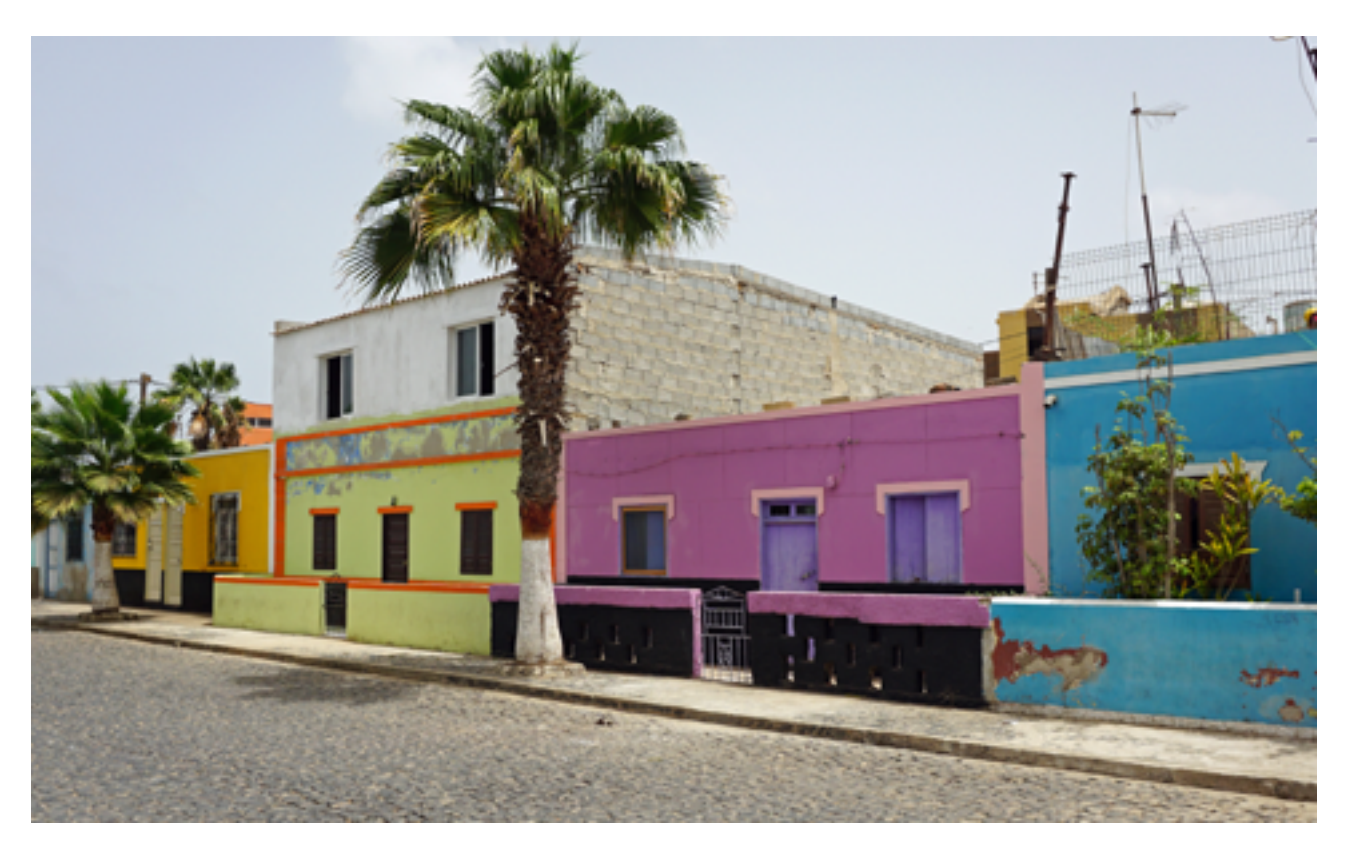
Picture 1: Village Palmeira on Sal island, Cabo Verbe

The assessment took place between mid-May and the end of June 2019. The overall conclusion is that the EP&R system in Cabo Verde shows weaknesses that leave the country vulnerable to losses and damage to its development gains, and to potential loss of lives. Multiple aspects of the EP&R system should be simultaneously strengthened in order to prepare the country to better respond to crisis and disaster.