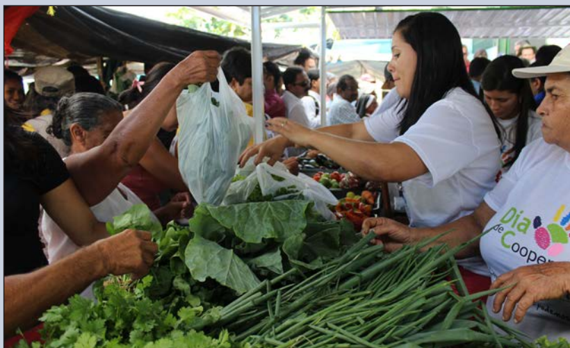
Members of cooperatives selling their produce.