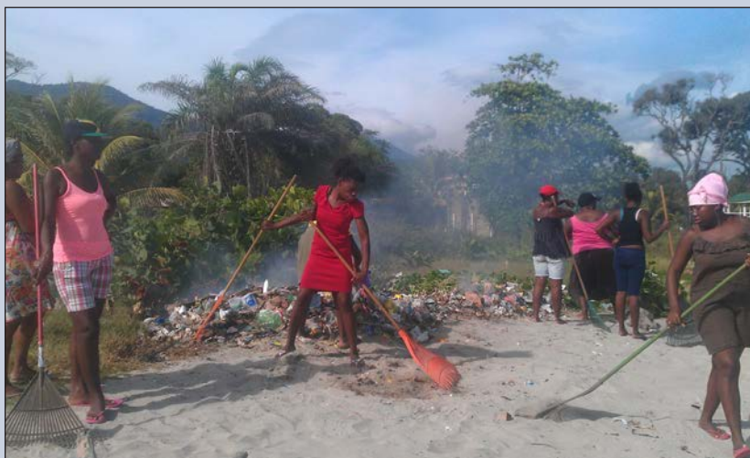
Members of WAGUCHA participate in a beach cleaning in the community of Corozol, Atlántida.