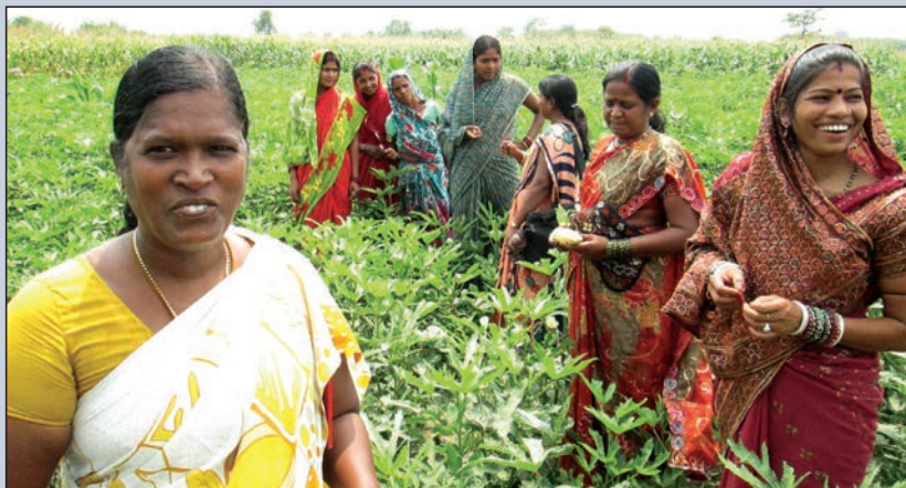
During a visit to Bihar by Maharashtra and Tamilnadu women.