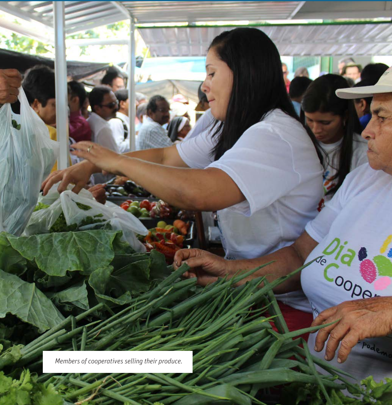
Members of cooperatives selling their produce.