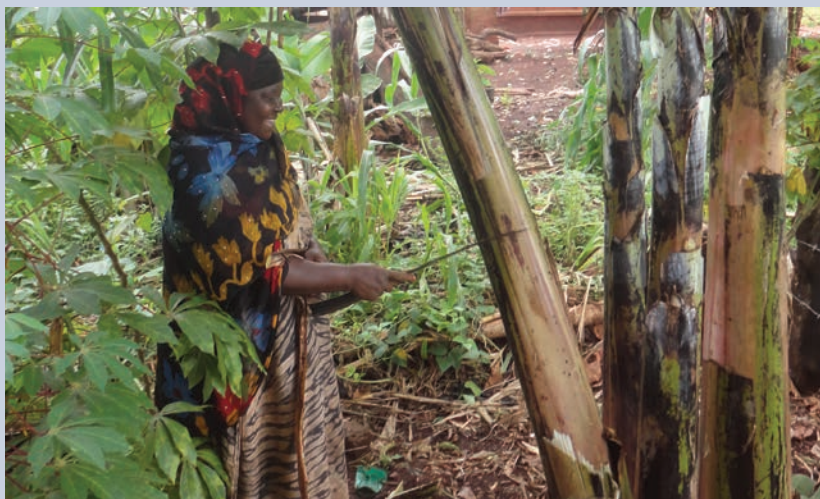
Member of SWID works on a demonstration garden.