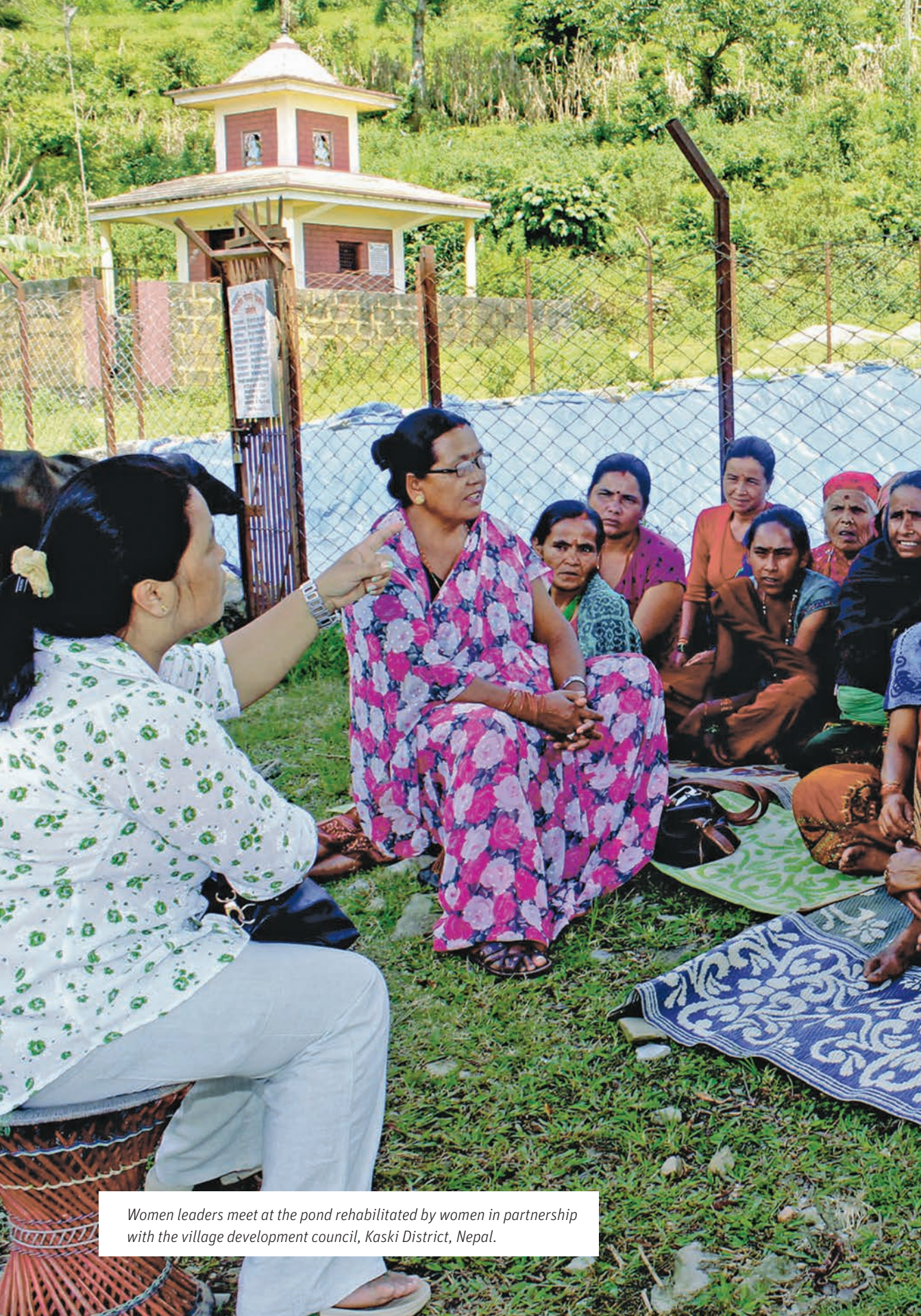
Women leaders meet at the pond rehabilitated by women in partnership with the village development council, Kaski District, Nepal.