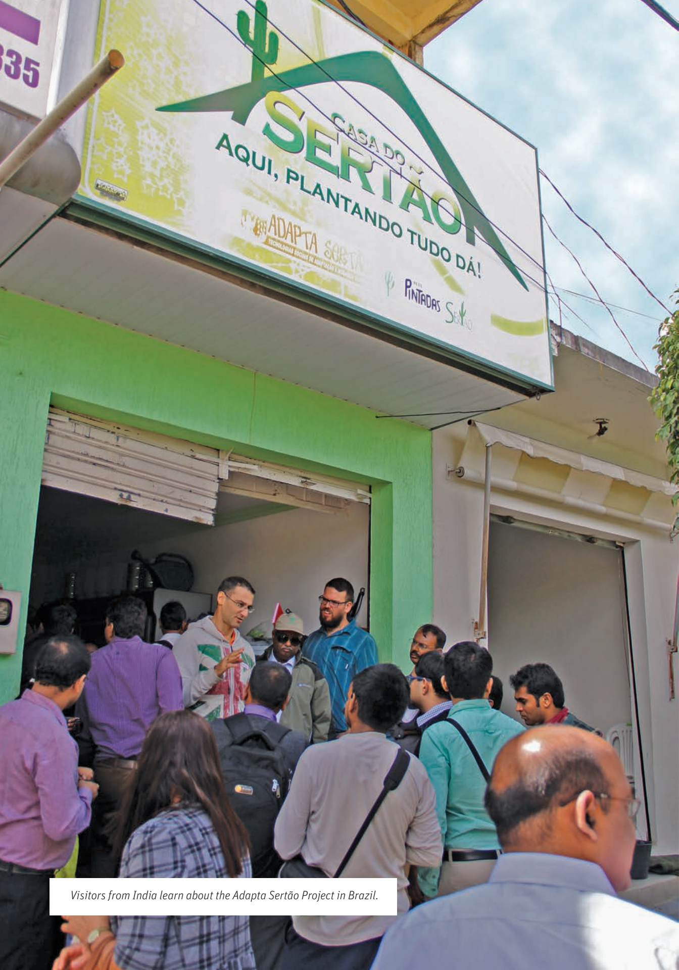
Visitors from India learn about the Adapta Sertão Project in Brazil.