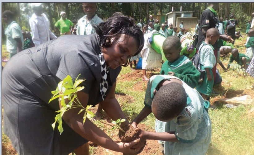
School tree planting program.