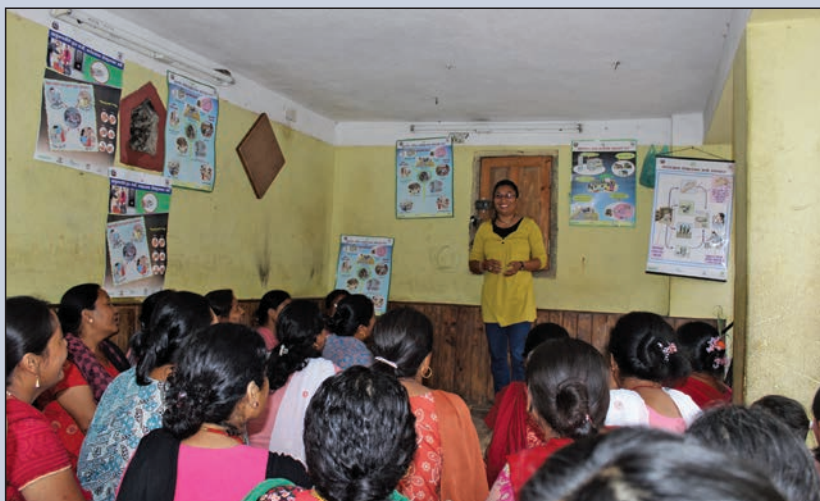
Lumanti Support Group for Shelter in Kathmandu.