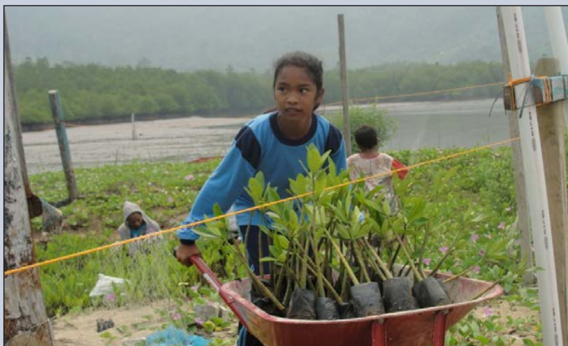
Student of Secondary School 37 Teluk Kabung Selatan and the communities took the seedlings from the seeding area.